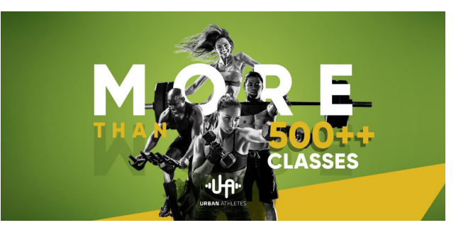
Figure 1. Urban athletes view

that continue to increase, Urban Athletes sees more and more people who do not care about health. This motivates Urban Athletes to provide a special place for those who want to make healthy living as a lifestyle with the right and fun method (Urbanathletes, 2017).