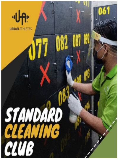
Figure 4. Cleaning sterilization standards

lifestyle, the first thing that comes to mind is sports. Right now, there are a lot of sports that are packaged in a more fun way, one of which is the TRX Suspension Training, namely the Total Body Resistance Exercise. As the name implies, TRX Suspension Training can help programs in losing weight and building muscle relatively quickly, helping them train after an injury to train their core muscles and improve posture.