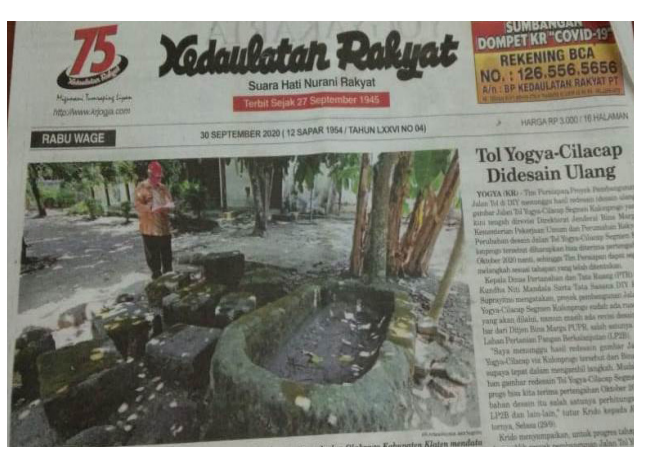
Figure 4. Local Print Media in Yogyakarta

The essence of strategic CRM is that the way to conduct customer-centric CRM activities. It is to create value for customers that is superior to competitors. KR, a newspaper that has been established early, had attracted society's interest in Jogja, especially those of mature age. Therefore, the content on KR also adjusted to the existing customer segmentation. It is done to increase customer satisfaction. It can be seen from KR's media appearance and writing style, which tended to be simple and iconic. The language chosen was also polite and did not display bombastic and phenomenal titles.