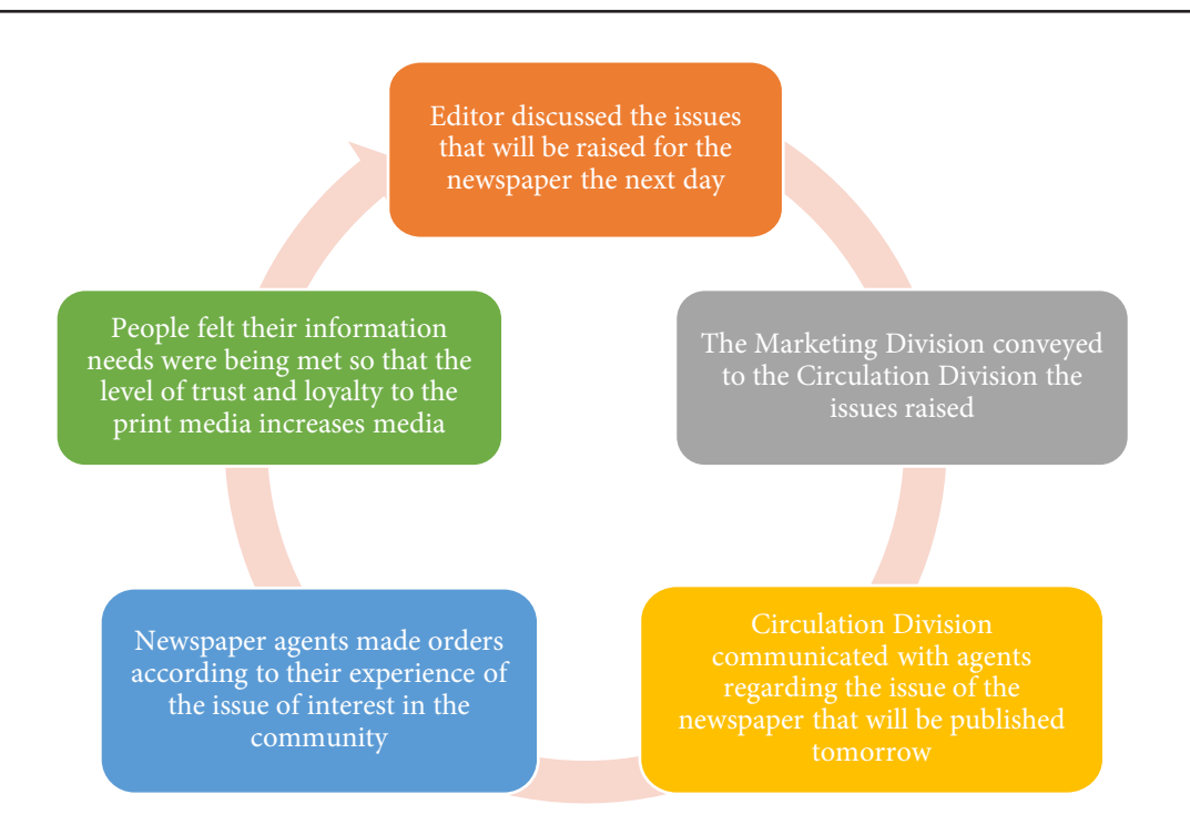
Figure 1. Circular Pattern in print media

media as a Trusted Information Guide. From this tagline, Harian Solopos wanted to create an image as a credible media with the products produced can be accounted for to customers.