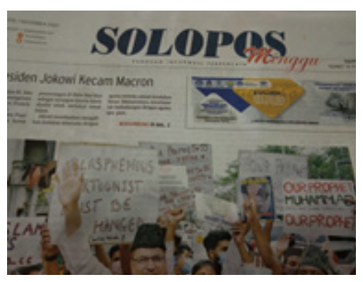
Figure 2. Local Print Media

media as a Trusted Information Guide. From this tagline, Harian Solopos wanted to create an image as a credible media with the products produced can be accounted for to customers.