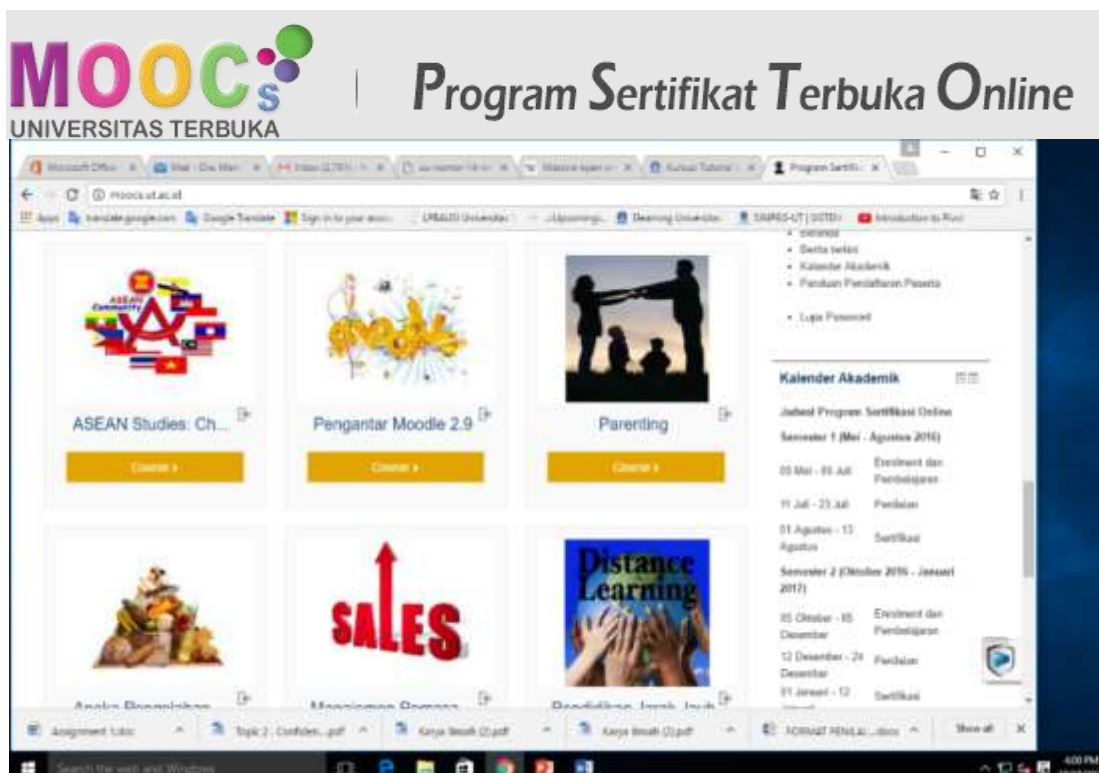
Picture 3. MOOCs UT Courses