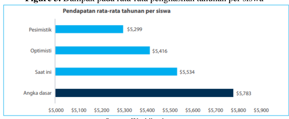
Figure 3. Dampak pada rata-rata penghasilan tahunan per siswa

In the next situation, the impact of the pandemic is felt by people in the lower middleclass with limited income during the pandemic. It is not easy to open up opportunities to buy PCs, Smartphones, or Laptops for online learning devices. In 2020 the World Bank released research results related to financial impacts related to students as described below: