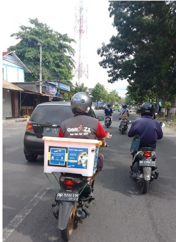
Figure 5. Geruzz Courier