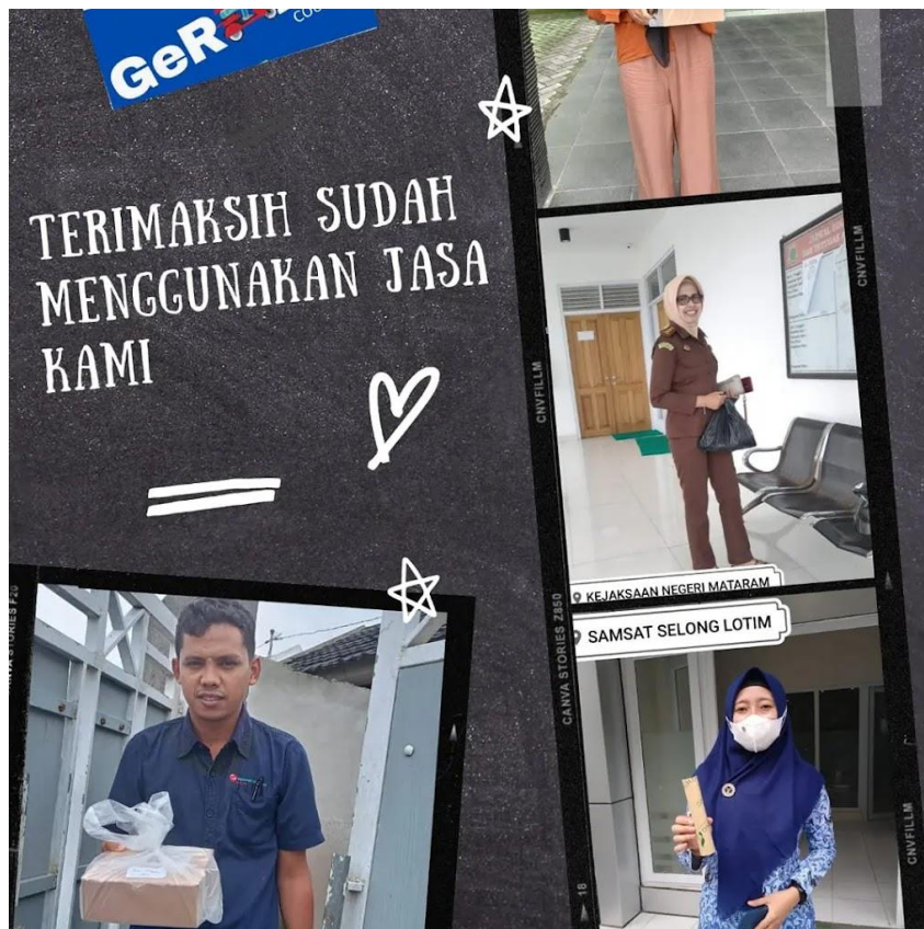
Figure 6. Geruzz Courier