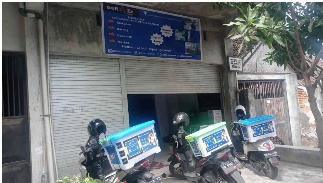
Figure 4. Geruzz Courier

The existence of online couriers has a positive impact on society in several ways, including job creation, alternative job choices, new job statuses, alternative fillers, financial independence, and equal opportunities for everyone to be themselves. The presence of online couriers makes transactions easier goods, goods delivery couriers who usually deliver packages or goods purchased due to an online buying and selling transaction.