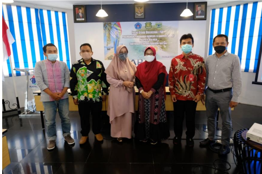
Figure 2. Group Photo After Focus Group Discussion (FGD) Activities in Batu City, October 1, 2021