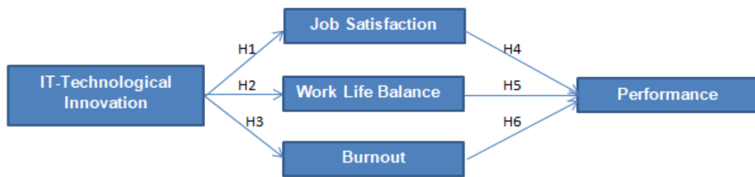
Figure 1. The research model