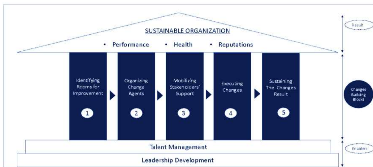
Figure 1. Change Building Blocks: A Conceptual Framework

studies. The five common change in building blocks consist of 1) identifying rooms for improvement, 2) organizing change agents, 3) mobilizing support, 4) executing change, and 5) sustaining the results. In addition, the critical role of talent management and leadership development in managing advancement and transformation are analyzed to support the building blocks related to preparing the change agents as enabling factors. Therefore, organizational change and transformation are expected to produce improvement in performance, health, and reputation, which are key elements of organizational sustainability. The literature review further provided a bridge between the existing theory and the study's context (Ridley, 2012). Fig. 1 describes the research conceptual model.