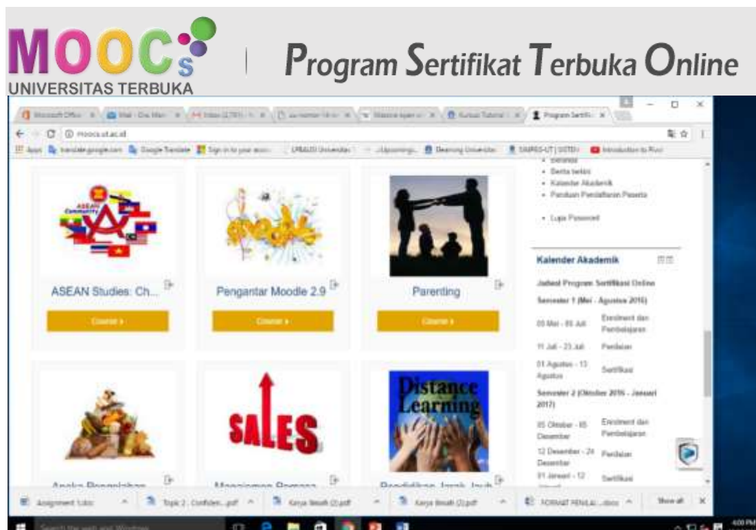
Picture 3. MOOCs UT Courses